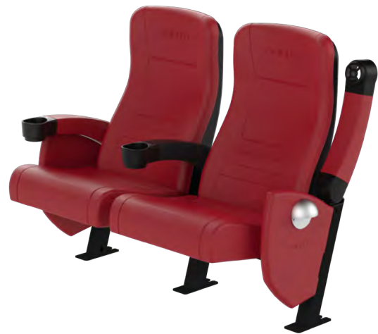
ACTIVA FIXED SEAT

Designed in consultation with world renowned ergonomists, the Activa range offers extremely high levels of comfort in both fixed and reclining backrest versions. From GA, Club and Premium seating, Activa provides venues with a range of exciting design alternatives and has proven itself in the market place for over 15 years.