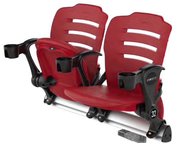
QUANTUM SLAT-BACK VIP

In line with the Quantum Series, The Quantum Slat-Back utilizes Camatics' patented beam-mount system which maximizes venue capacity and reconfiguration whilst also providing for faster installation and change-out times. The ergonomic profile of the Quantum Series remains in the slat back but with the design reminiscent of early 20th century baseball stadium seating and in doing so providing for a more breathable back support.